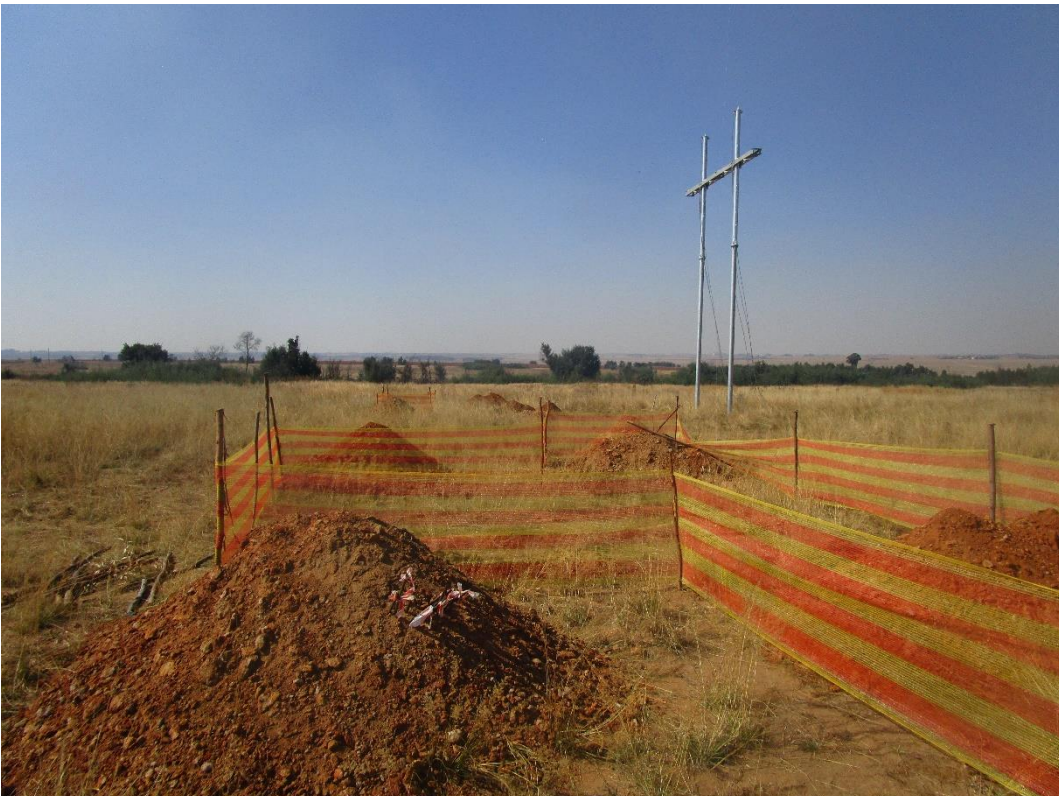
Figure 2: Activity on the day of audit.