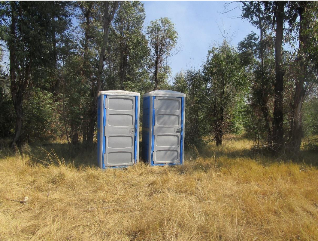
Figure 1: An extra ablution has been added on site.