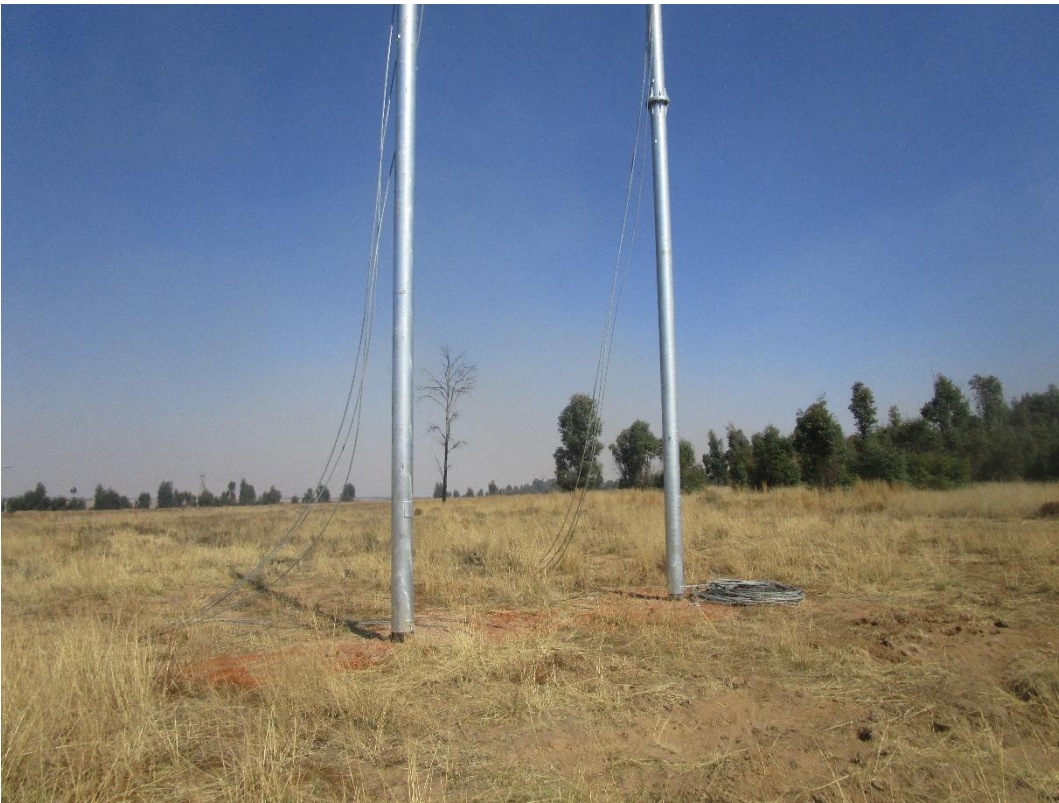
Figure 3: Poles for power line.