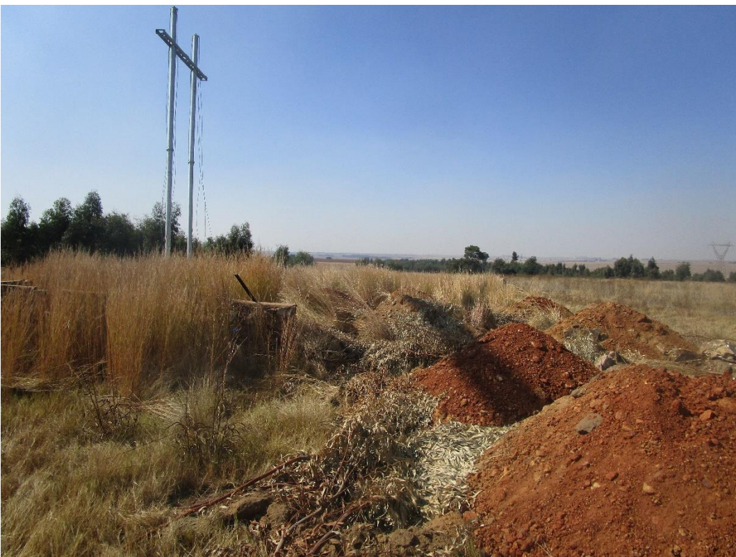
Figure 4: Extent of excavations on the day of the audit.